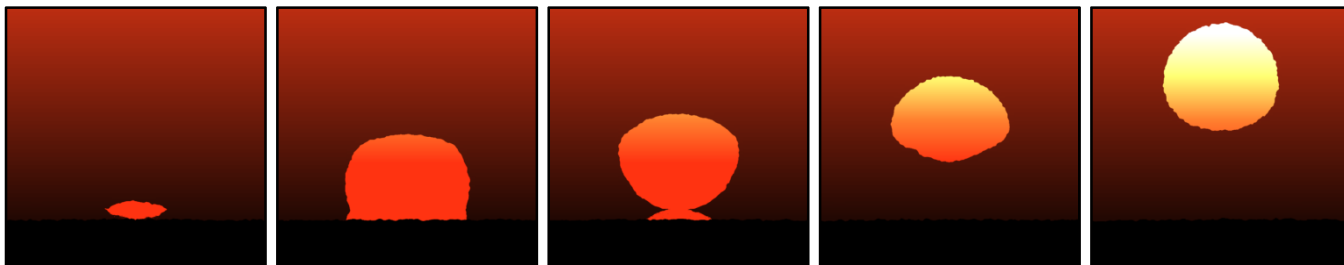
Figure 1. Images of square sun mirage generated by our method.

Tokiichiro Takahashi ‡* *UEI Research Senju Asahi-cho 5 Adachi-ku Tokyo {kanazawa, sakato, toki}@vcl.im.dendai.ac.jp